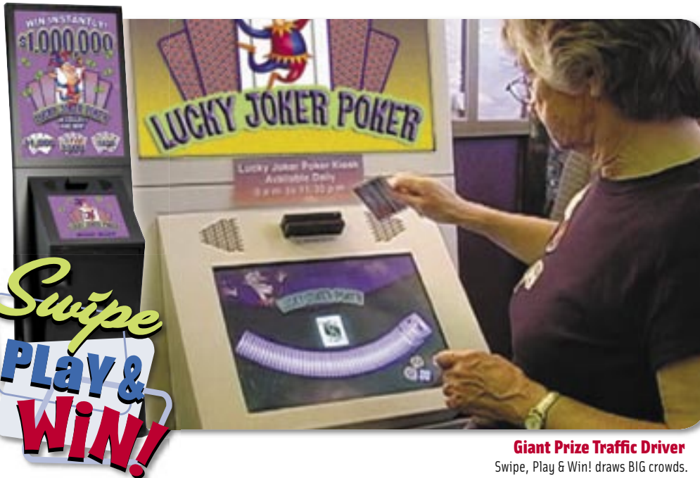
Giant Prize Traffic Driver Swipe, Play & Win! draws BIG crowds.

Sands Regency Doubles Local Business with $100,000 Lucky Joker Poker