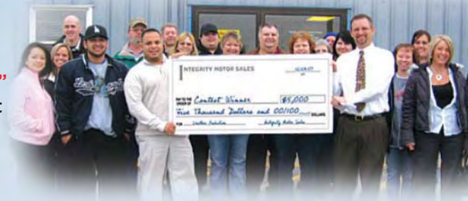
The staff at Integrity Motors shows off their big check.